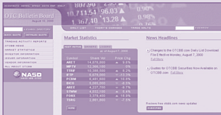
Coming Soon: New OTCBB Home Page

Please direct any questions regarding these website changes to Liz Heese at (202) 728-8191. ■